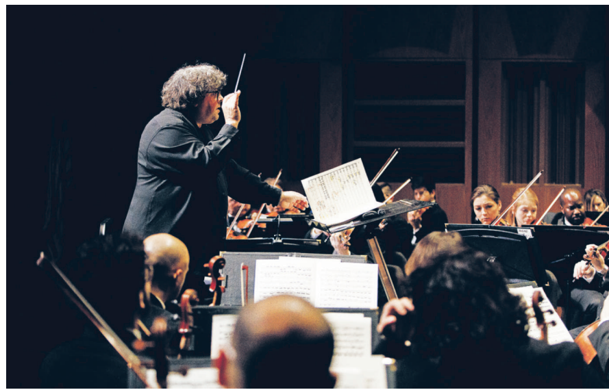
The Villages Philharmonic Orchestra will start off the holiday season with "Messiah," an elegant Christmas concert composed by George Frideric Handel in the 18th century.